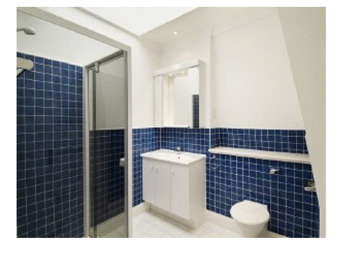
Arbitrage – Real Estate investments in London